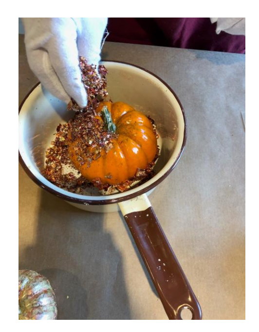
Swirl your pumpkin!