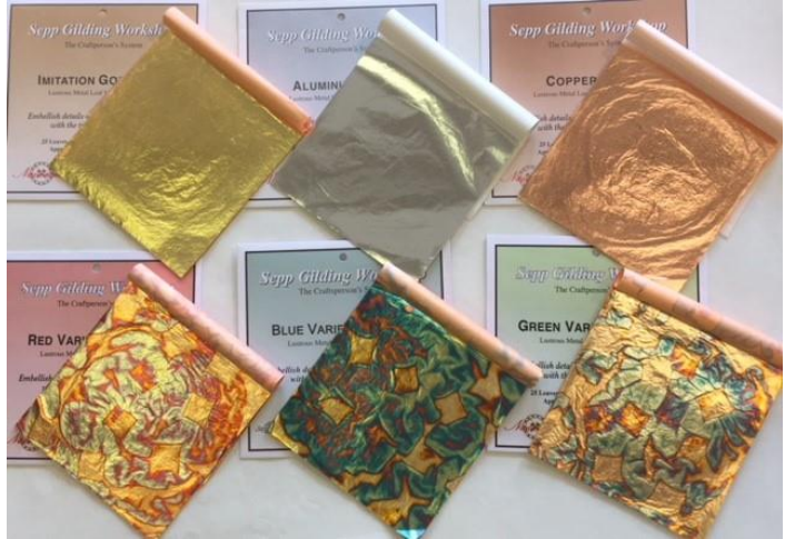
Sepp Gilding Workshop Leaf – Imitation Gold, Aluminum, Copper, and Red, Blue and Green Variegated

Sepp Gilding Workshop (SGW) also offers Gilding Kits with varying colors of leaf and primers, along with size, brush, stir stick and even gloves. SGW also offers Red, Yellow and Gray primers, and Imitation Gold, Aluminum, Variegated Red, Blue and Green Leaf separately.