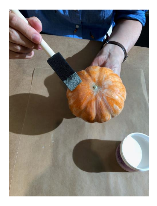
and turns clear as it reaches tack

Lightly load your foam brush and apply enough SGW Water-Based Size to leave a thin white coating all over the pumpkin. Rest the sized pumpkins on wax paper. The SGW Size will quickly shift from milky white to glossy and clear (in about 20 minutes), then the pumpkin is ready to gild. Check that the glue feels dry but tacky.