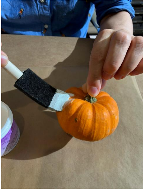
The size goes on milky white